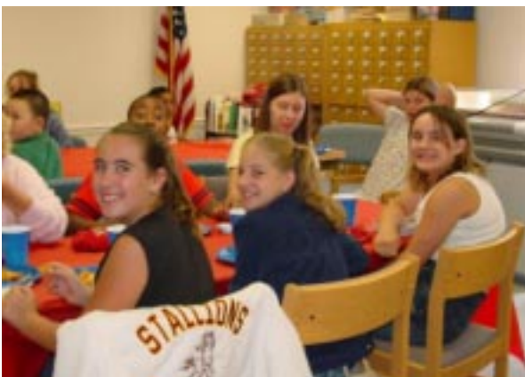
YAC teens enjoy a picnic meeting

Are you in Jr. High or High School? Join us at our next Youth Advisory Club (YAC) meeting, and bring your ideas about the kind of materials and programs you would like to have at the Library. It's a great way to contribute to your community, and we have food and fun, too! On your next visit to the Library, leave your name and phone number. Join us June 26 at 7 p.m.