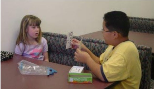
A “flash card fun” practice session in progress

The Library encourages students to practice their reading and math skills during the summer. Join our “Practice Pal” program which enlists the help of Junior High volunteers who work with younger children by playing educational games that help them enhance skills. Please register to be a Practice Pal or to participate!